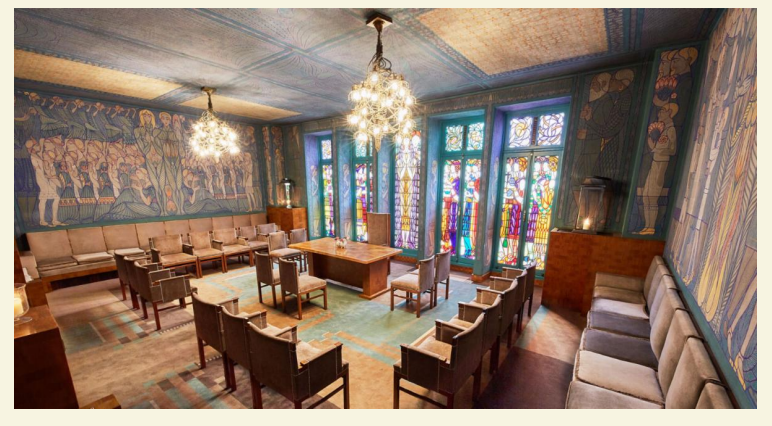
Top 25 Historic Hotels Worldwide® Most Magnificent Art Collections