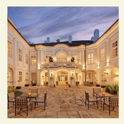
The Mozart Prague (1493)