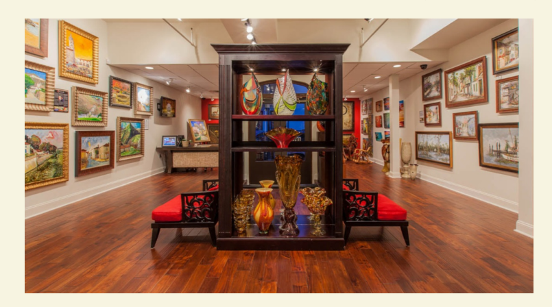
Top 25 Historic Hotels of America® Most Magnificent Art Collections