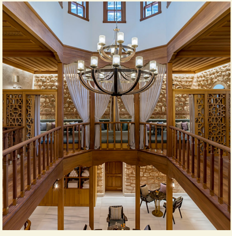
The Galata Istanbul -MGallery by Sofitel (1720)