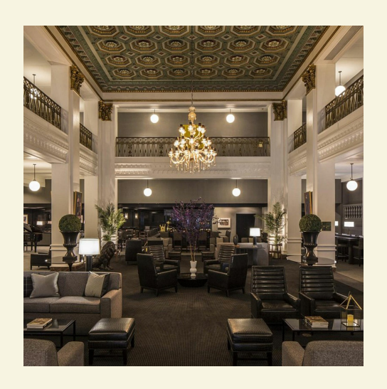
Lord Baltimore Hotel (1928) Baltimore, Maryland

Members, donors, supporters, and volunteers of the National Trust for Historic Preservation, as well as its historic sites and its affiliates or of organizations deemed Friends of Historic Hotels of America®, all save up to 30% off the Best Available Rate at participating hotels.