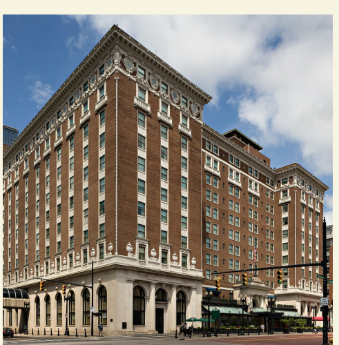
Amway Grand Plaza, Curio Collection by Hilton (1913) Grand Rapids, Michigan