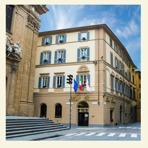
Bernini Palace Hotel (1500)